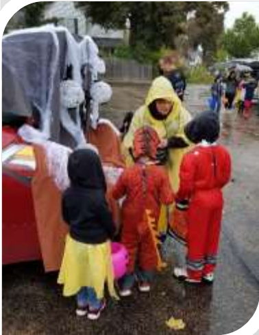
A rainy October day didn't deter neighborhood children from donning their costumes and "Trunk or Treating" in the church parking lot.

“Do not neglect to show hospitality to strangers, for thereby some have entertained angels unawares.” Hebrews 13:2