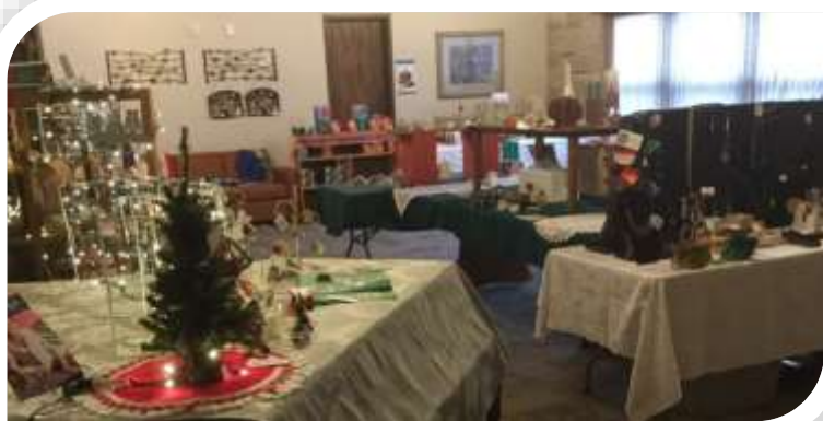
The annual SERRV sale provided the perfect opportunity to purchase unique holiday gifts made in fair trade conditions.