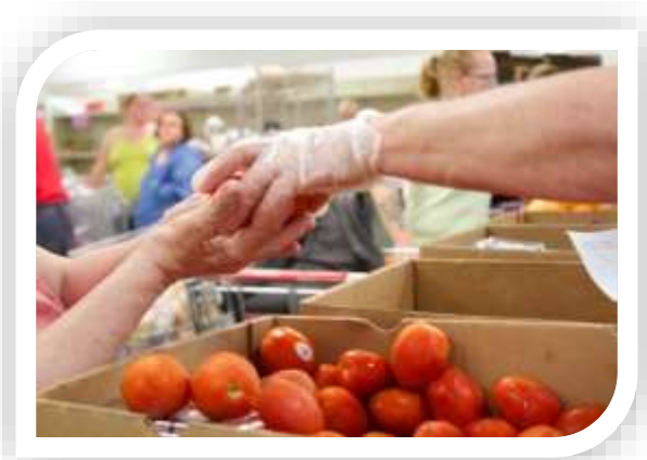
The MPC garden yielded one-third of the total produce donated to St. Joseph Food Program in 2017.

“We can’t move people out of their situations without having nutrition, so we’ve really focused on getting them the best nutritional foods that we can. The MPC garden effort in this goal is huge. We just can’t do it all, and it takes all of our outside community-based efforts to provide nutritious produce all summer long. And the MPC garden has been so successful and has set such a great example for other community businesses and agencies, that they’ve been inspired to start their own gardens, as well.”